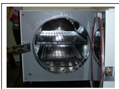
Purchased Autoclave April, 2013