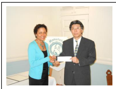
Signing Ceremony March 29, 2012