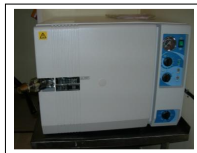
Purchased Autoclave April, 2013