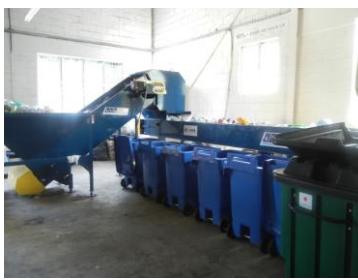
Classification process workshop (Now)