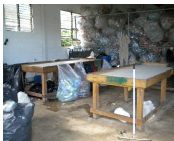
Classification process workshop (Before)