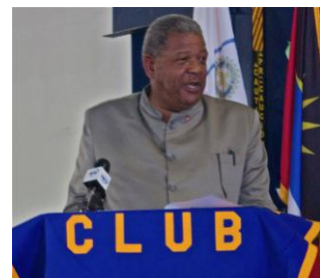
Handing-over Ceremony November 7, 2012