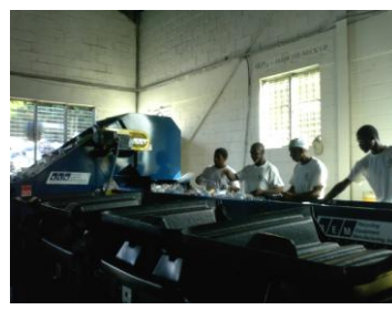
Staff classifying the recyclable materials with the new equipment (Now)