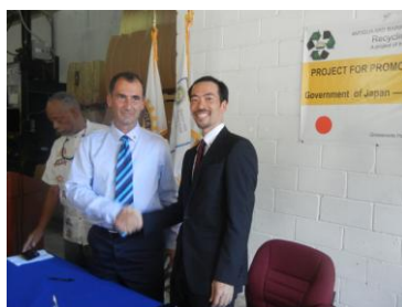
Signing Ceremony February 9, 2012