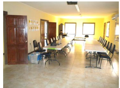
Expanded Building (Dec, 2010)