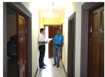
Expanded Building (Dec, 2010)