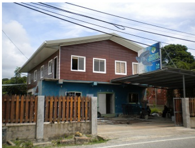
Expanded Building (Aug, 2010)