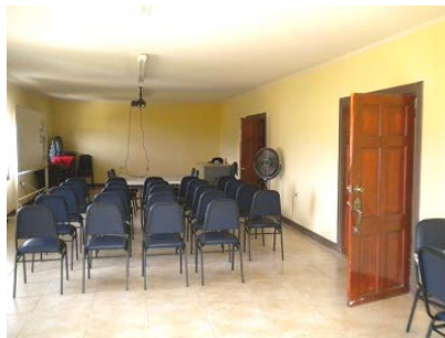
Expanded Building (Aug, 2010)