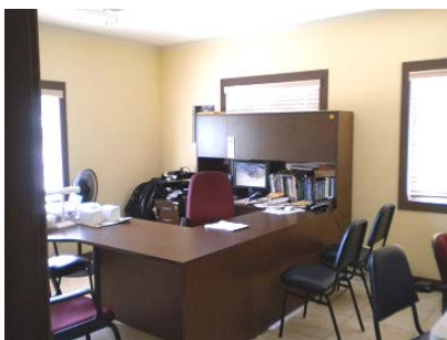
Expanded Building (Aug, 2010)