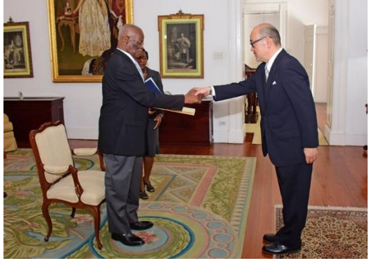
Presentation of credentials to H. E. Sir Elliot Belgrave, Governor General