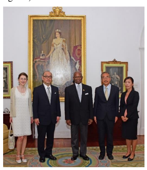
The Ambassador and his wife, and other Embassy diplomatic staff with the Governor General