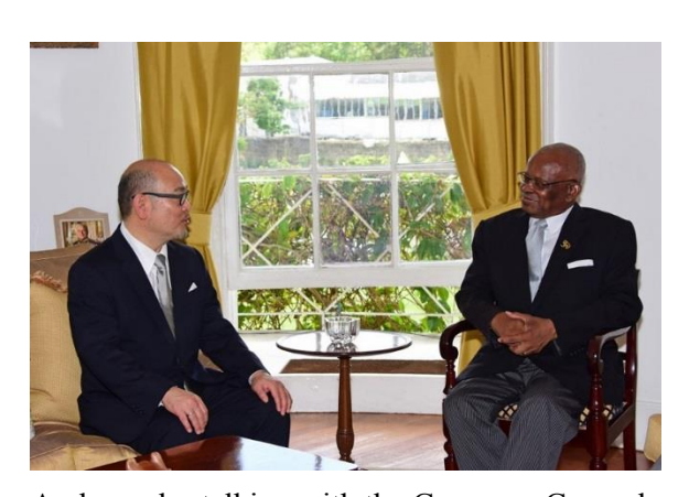
Ambassador talking with the Governor General