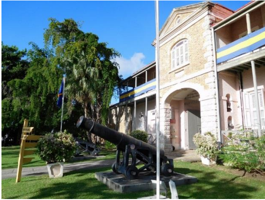
The Barbados National Museum

From December 5 th – 15 th 2017, we held a Japanese Calendar exhibition at the Barbados National Museum. There was an opening ceremony on the 5 th , before it was opened to the public from the 6 th . It was the first Japanese calendar exhibit in Barbados, so many people visited and enjoyed. On the last day, the calendars, along with origami craft, were distributed to the visitors.