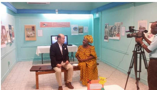
Ambassador giving an interview on local TV station, CBC