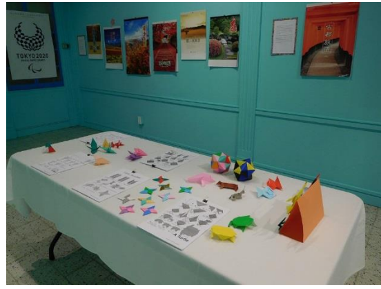
Origami craft exhibition