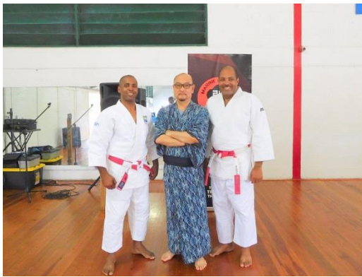
With members of the Judo clubs