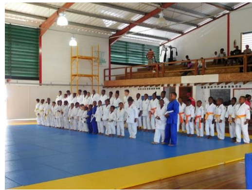
Marine Garden Judo club and others