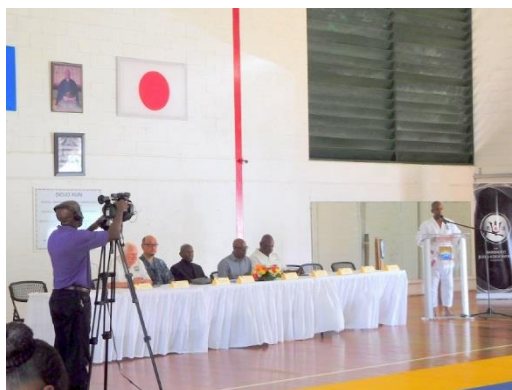
Local TV station, CBC, filming the ceremony