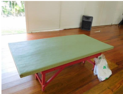
Assistance sent from the other side of the world