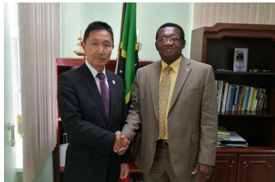
Meeting with the Honourable Eugene Alastair Hamilton, Minister of Agriculture