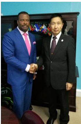
Meeting with the Honourable Mark Brantley, Minister of Foreign Affairs