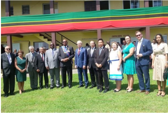
Independence celebration attended by H.E. Sir Tapley Seaton, Governor General of Saint Christopher and Nevis, Prime Minister Harris, and ambassadors accredited to the country