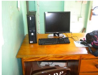
Computer (Nov, 2011)