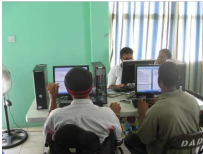
Computers (Oct, 2009)