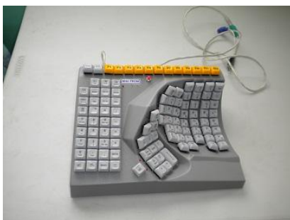
Key-Board (Nov, 2011)