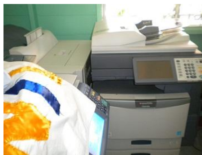
Copy Machine (Nov, 2011)