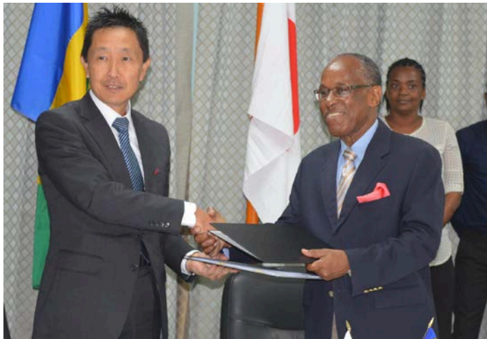
The Official Exchange of Notes

For further information, please contact: Economic Cooperation Section Embassy of Japan in Trinidad and Tobago Tel: (868)-628-5991/3 Ext. 227 Email: ecocoop@po.mofa.go.jp