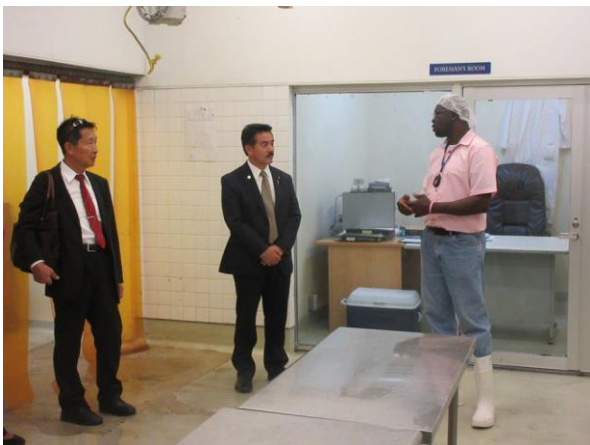
H. E. Sato in a visit to the Point Wharf Fishery Complex