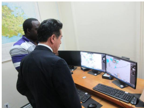
H. E. Sato in a visit to the Point Wharf Fishery Complex