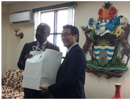
Honourable E. P. Chet Greene, Minister of Foreign Affairs, Immigration and Trade