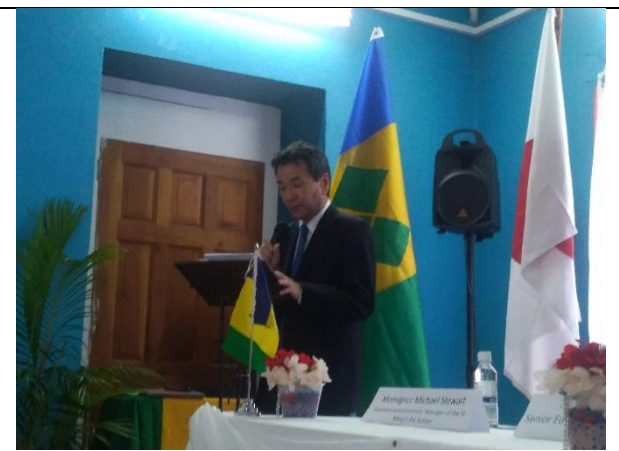
Ambassador Hirayama delivers remarks on behalf of the Japanese Government