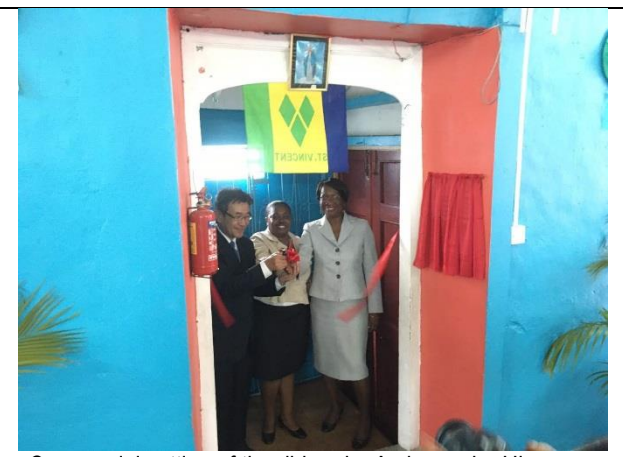
Ceremonial cutting of the ribbon by Ambassador Hirayama