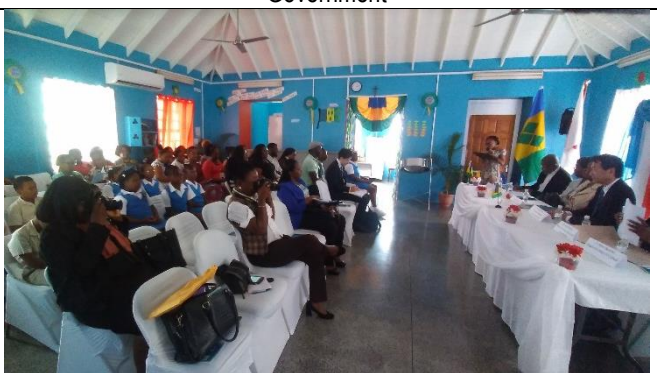
Attendees at the ceremony