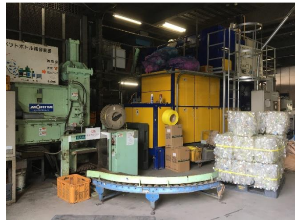
Recycled waste (PET bottles)