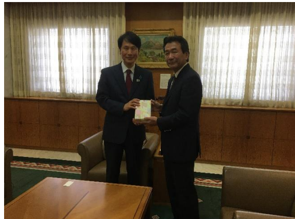
Meeting with the Governor of Mitazono, Kagoshima Prefecture