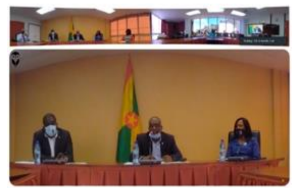
Minister Joseph delivers remarks