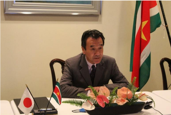
Ambassador Hirayama delivers remarks