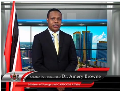
Video message from Honourable Dr. Amery Browne, Minister of Foreign and CARICOM Affairs