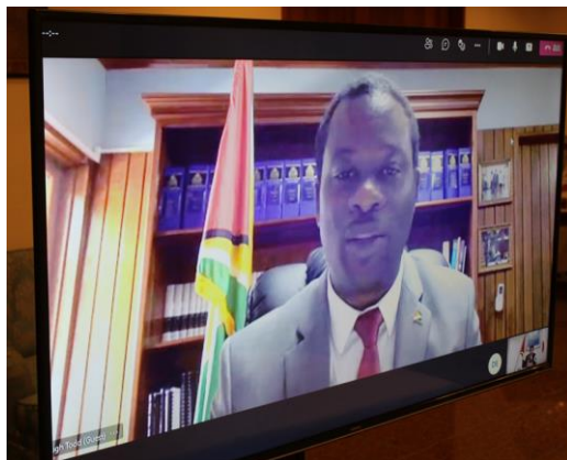
Virtual meeting between Honourable Hugh Hilton Todd, Minister of Foreign Affairs and International Cooperation (Left) and Ambassador Hirayama, Ambassador of Japan to the Cooperative Republic of Guyana (Right)