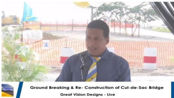
Ground Breaking & Re- Construction of Cul-de-Sac Bridge Great Vision Designs - Live