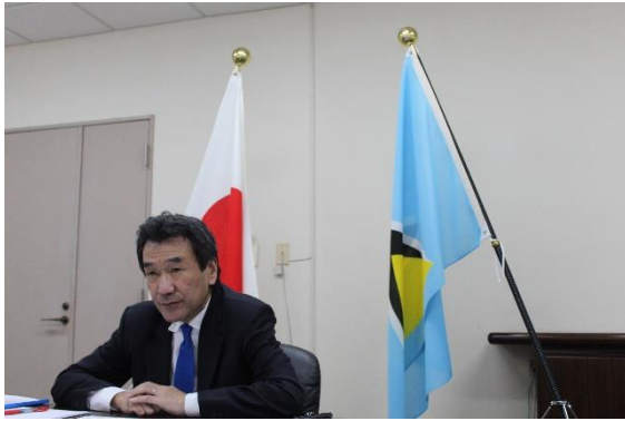
Ambassador Hirayama delivers remarks