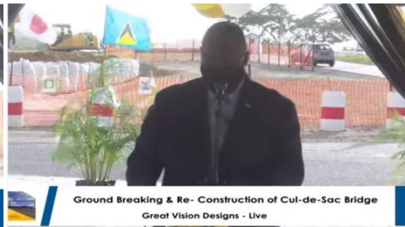
Ground Breaking & Re- Construction of Cul-de-Sac Bridge Great Vision Designs - Live