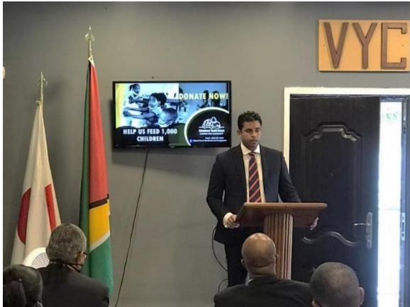
Minister Ramson delivers remarks