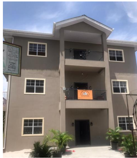
Photo of VYC Youth Center after renovation