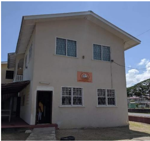
Photo of VYC Youth Center prior to renovation