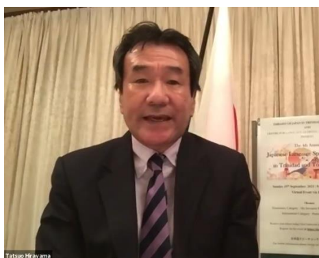
Ambassador Hirayama gives his remarks

Under the COVID-19 pandemic, the Contest went to an online event. At the same time, the Contest was attended more widely from various regions including Japan. The contest were viewed by over 100 individuals from around the world.