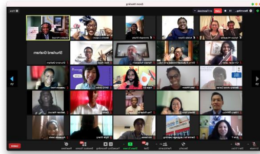
Screenshot of the Zoom Contest