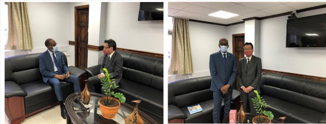
Courtesy call upon the Honourable Philip J. Pierre, Prime Minister