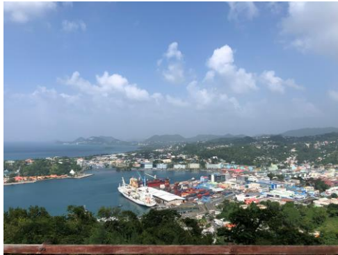
Townscape of Castries, the capital of Sain Lucia

For further information, please contact: