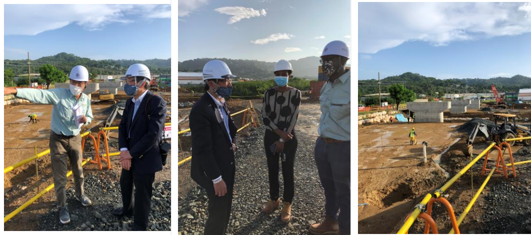
Visiting Cul-De-Sac Bridge