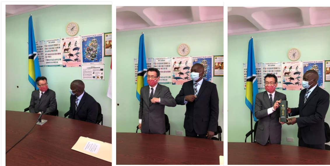
Courtesy call upon the Honourable Alfred P. Prospere, Minister for Agriculture, Fisheries, Food Security and Rural Development