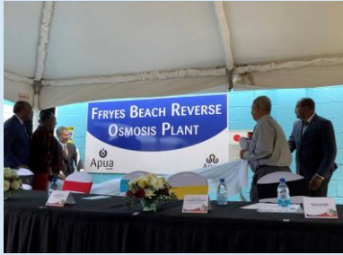
Ffryes Beach Reverse Osmosis Plant

The Government of Japan's Basic Policy of Assistance is Overcoming Vulnerability and focusing on the priority areas of Environment , Disaster Risk Management and Fisheries .