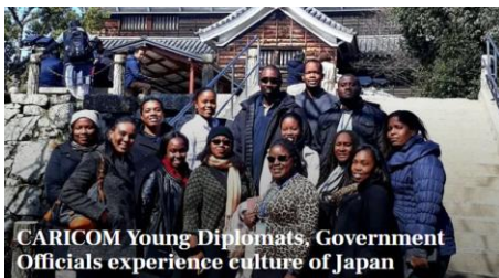
CARICOM Young Diplomats, Government Officials experience culture of Japan