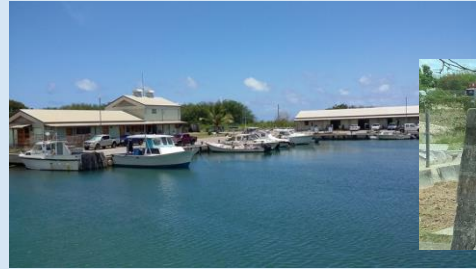
Urlings Fisheries Complex