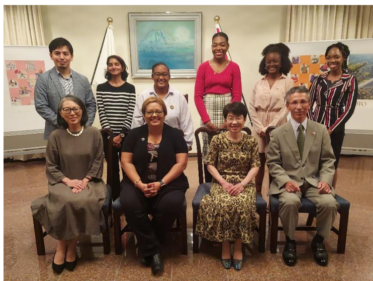
Group photo with winners and participants of the Japanese Language Speech Contest