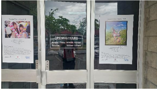
Posters on display