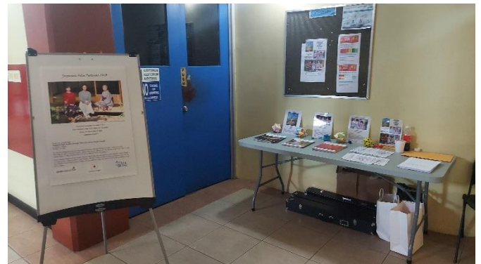
Entrance to the auditorium