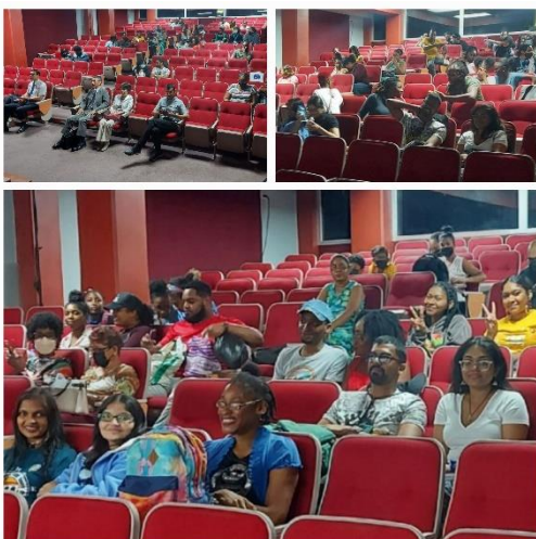
Audience for the Movies