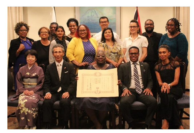
Group Photo with representatives from the Centre for Language Learning (CLL)