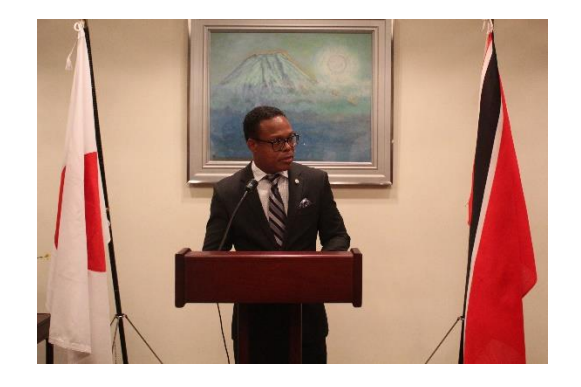
Remarks from Senator the Honourable Dr. Amery Browne, Minister of Foreign and CARICOM Affairs