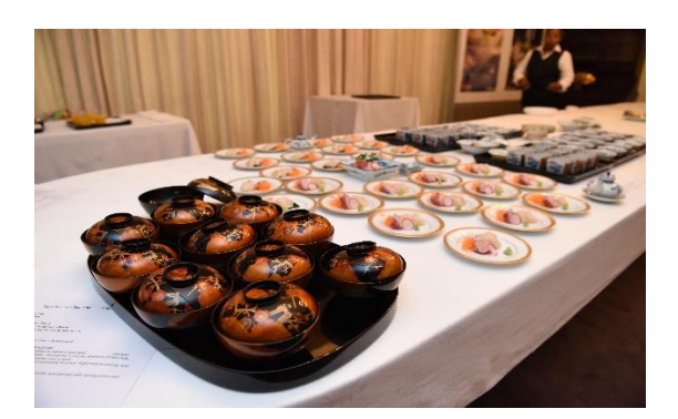
A selection of yellowtail and scallop dishes