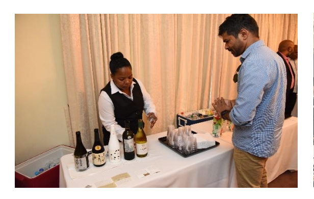
A guest decides on sake