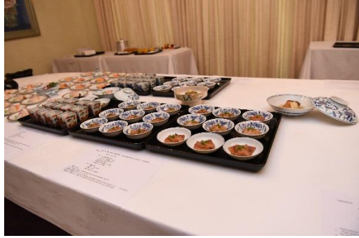
A selection of yellowtail and scallop dishes