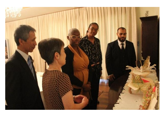
Guests discuss Japanese Art