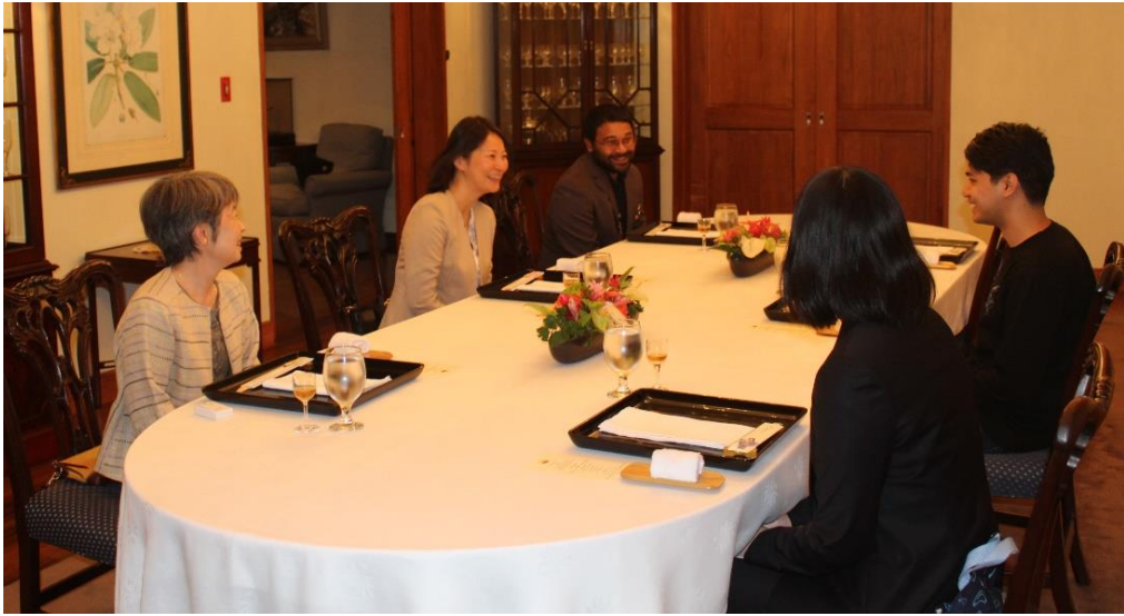
Lunch in Progress