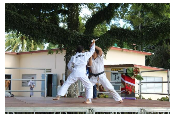
Japanese Martial Arts.