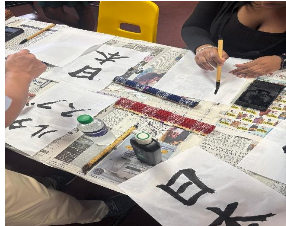
Parents practiced writing calligraphy