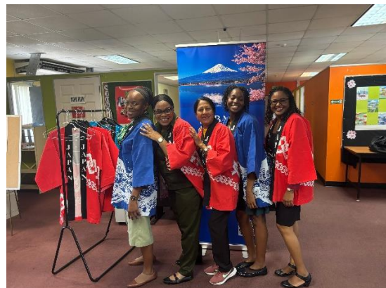
Parents and staff pose with happi coats