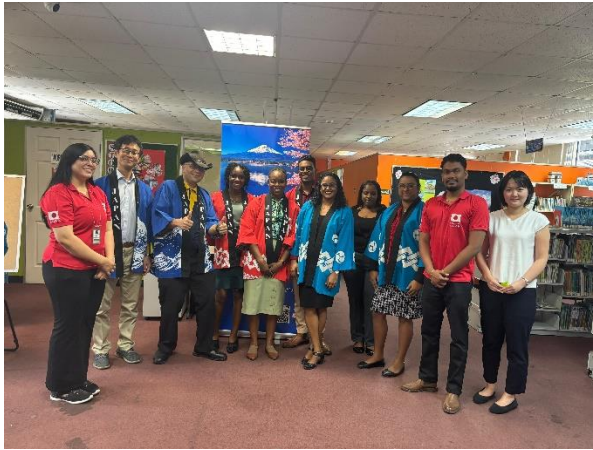
NALIS and Embassy staff pose for a picture