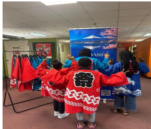
Children pose with happi coats