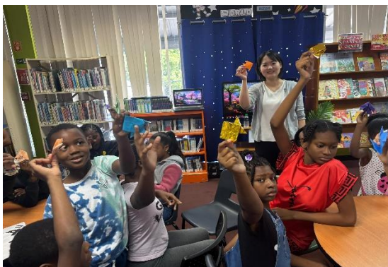
Children show off their origami creations