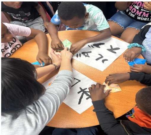
Children practice origami