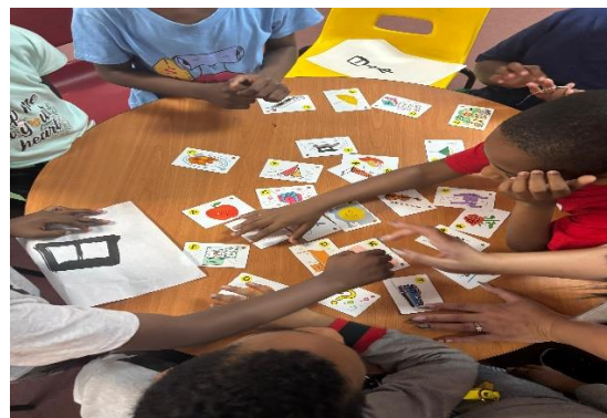
Children play a game of Karuta