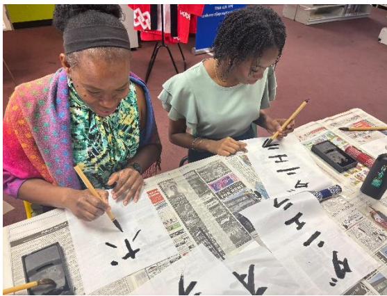
Parents and staff practiced writing calligraphy