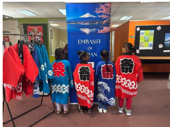
Children pose with happi coats