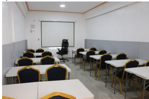
Interiors of the new classrooms.