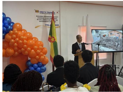
Ambassador UMEZAWA Akima delivers remarks.